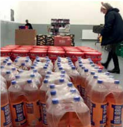
▲ Now where did I leave my list?