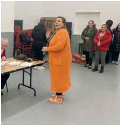
▲ In good humour, Agency representatives queue at uplift