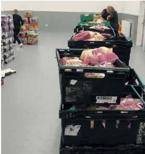
▲ Almost there