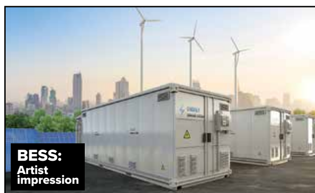
BESS: Artist impression

Exciting times and as always, we remain 100 per cent committed to Dalry.